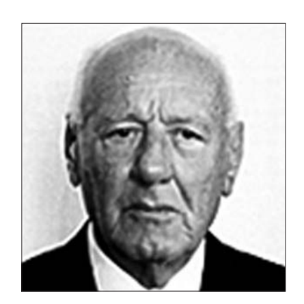
Figure 5. Luigi Bernabò Brea.

However, on the basis of a correct stratigraphical excavation of the Arene Candide cave site, Bernabò Brea, for the first time, designed a correct chronotipological sequence for the Neolithic and Bronze Ages, beginning modern Italian prehistoric archaeology.