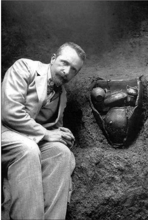
Figure 3. Giacomo Boni, sitting near an Iron Age grave in the Roman Forum.

in the field of Classical archaeology, that comprise the outstandingly well documented exploration of the pre-Roman necropolis in the Forum. Boni also wrote and published a booklet on the methodology of excavations, which remains surprisingly modern in its strong advocacy for the ‘deductive’ approach to archaeological interpretation.