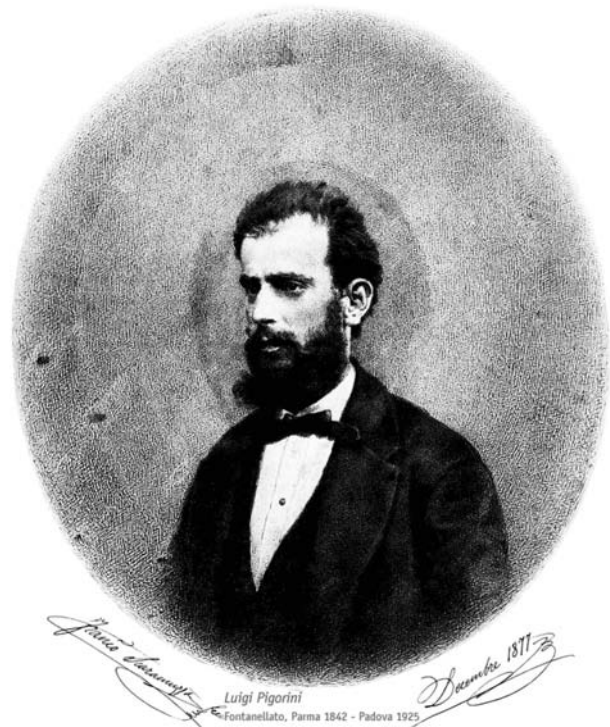
Figure 2. Luigi Pigorini.

During these years only a few scholars stand out, and only two of them were well known internationally: Paolo Orsi and, in particular, Giacomo Boni (see Figure 3). The latter was a great archaeologist, an atypical Italian, and well known for his international contacts, from Apollinaire to Ruskin (the latter being the English architect with whom he established a strong relationship). In the first two decades of the twentieth century Boni directed the Rome Superintendance, the first stratigraphical excavations