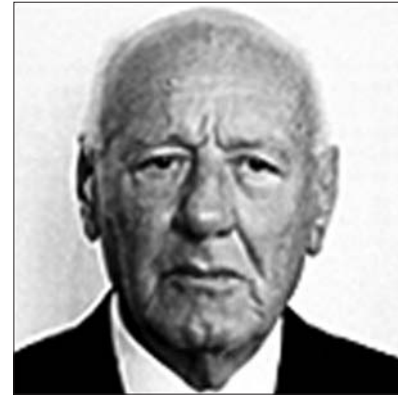
Figure 5. Luigi Bernabò Brea.

However, on the basis of a correct stratigraphical excavation of the Arene Candide cave site, Bernabò Brea, for the first time, designed a correct chronotipological sequence for the Neolithic and Bronze Ages, beginning modern Italian prehistoric archaeology.