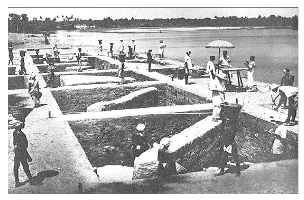
The development of the archaeological methodology in a colonialist context: the application of the Wheeler Method in Arikamedu (India). From: Daniel 1981.