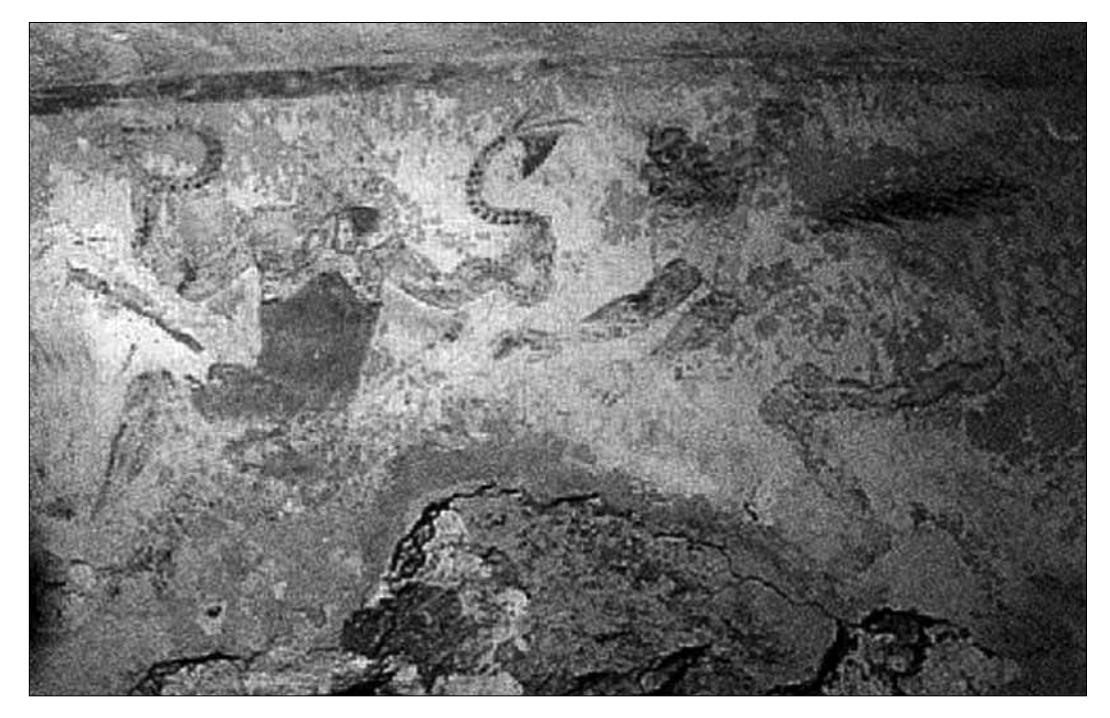
Fig. 2: Image of Etruscan Demons, Tomb of the Blue Demons, Tarquinia.

specificity of a cultural group: rather than ignorance, it is deliberate exclusion that keeps the Etruscans unnamed and unglorified. As pagan barbarians, they were not a people to credit with the foundation of Italian cities.