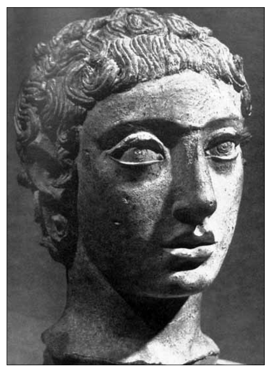
Fig. 4: Head of Malavolta from Veii.