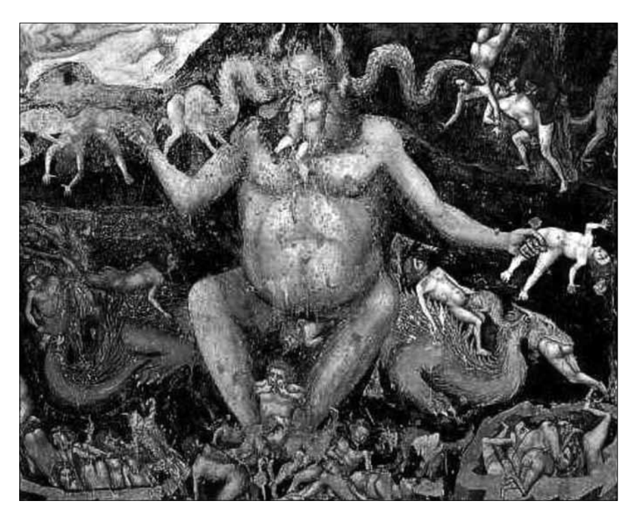
Fig. 1: Image of Satan from Giotto's Last Judgement in the Scrovegni Chapel, Padova.