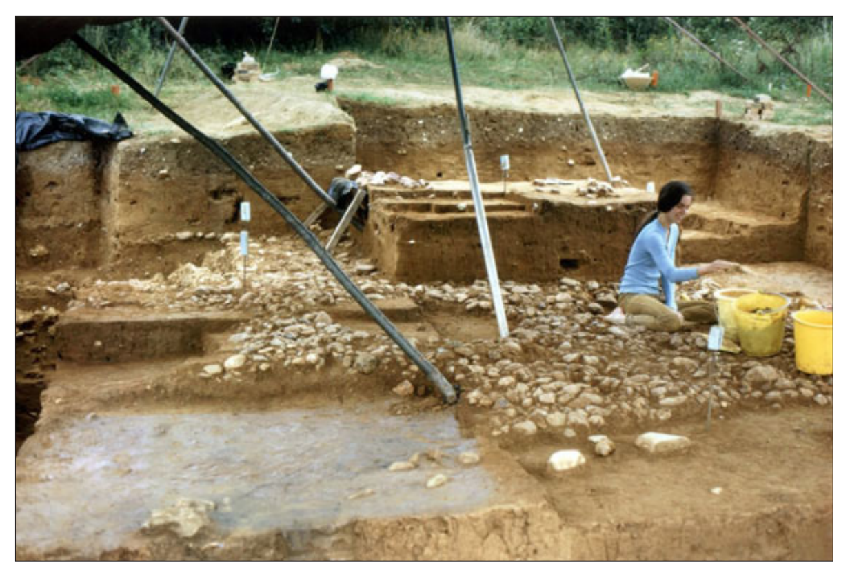
Fig. 5: A horizontal exposure of a stone pavage found in the uppermost Palaeolithic occupation floor at Solvieux.

There is little I can add, since I can recall Bordes speaking to me only twice about the matter, and even then simply in the form of casual remarks tossed off during the