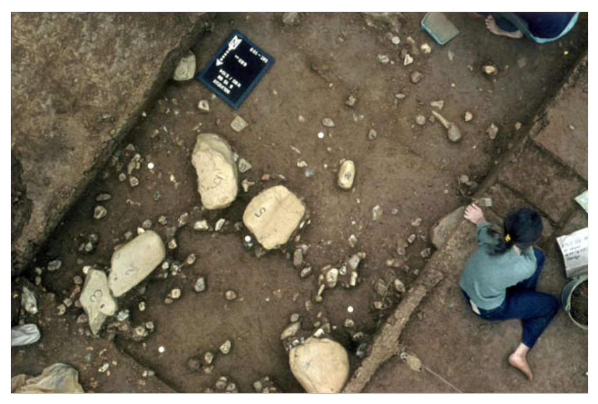
Fig. 6: A horizontal exposure of a stone pavage found in the uppermost Paleolithic occupation floor at Solvieux.

course of fieldwork. The first time, he said that he in fact initially suspected that the Mousterian assemblage types were indeed activity-specific, most likely representing varying expressions that one and the same culture might take in its seasonal rounds; and that he only later abandoned this view because he could find no corresponding differences in their associations with faunal assemblages, hearths, site organization, and so forth. I took this to mean that he viewed the question of Mousterian variability – as he did most Palaeolithic issues – as a largely empirical question that could only be resolved on strictly empirical terms. Here of course he was speaking in the guise of a straight archaeologist for whom palaeoethnological interpretation could wait. The second time the subject came up his words took a more cynical turn: in short, that the debate's real value lay in the fact that it was an easily grasped and easily popularized matter that served to promote his reputation among Anglo-Saxon archaeologists and students who were otherwise too ignorant of Palaeolithic archaeology to know the difference between a burin and a hand-axe.