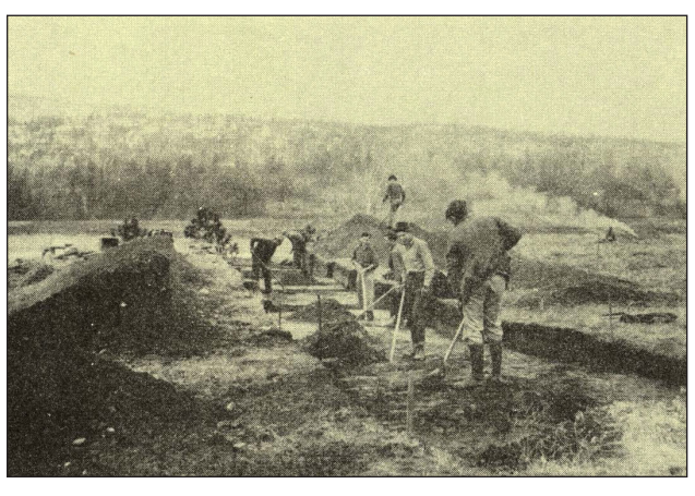
Figure 4: NYA crew excavates a trench in Site 34, near the Columbia River. Adapted from Collier, Hudson and Ford (1942: Plate 18b).