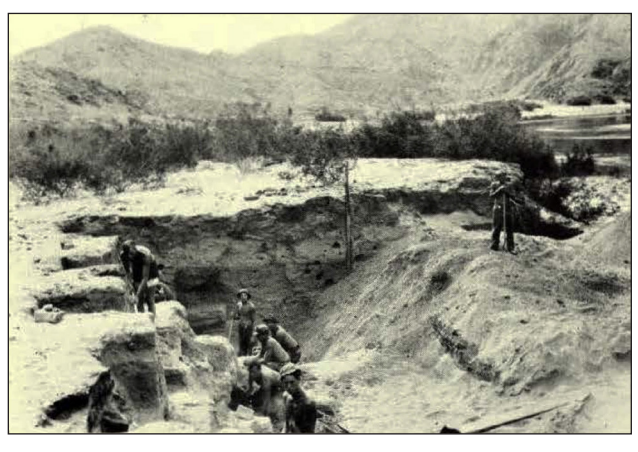
Figure 3: CCC crew works on a stratified site near Boulder (now Hoover) Dam. Adapted from Harrington (1937b: 87).

Online access to archived journals is certainly critical to my efforts to examine all New Deal archaeology survey and excavation efforts on a national scale. A search through American Antiquity for the 1930s and 1940s turned up numerous references to federal work relief archaeology, including one project that involved NYA labor (Fig. 4) to excavate sites in the Columbia River Basin to be flooded by the construction of the Grand Coulee Dam in Washington State (American Antiquity 1940: 177). The original report on the Grand Coulee Dam project is a rather comprehensive and honest appraisal of the efforts of academic archaeologists to work with the NYA. This work relief project saw many challenges in excavating sites in advance of the rising flood waters and working with young men during a winter 'hampered by severe weather and frozen ground' (Collier, Hudson and Ford 1942: 11). The project ran from September 1939 to 1940 (Collier, Hudson and Ford 1942: 3) and had four different directors during this time. Collier, Hudson and Ford (1942: 11) acknowledged that: 'It is obvious from the above brief history of the project that it did not operate under the most favorable conditions. Certainly the greatest difficulty, as revealed in the preparation of the results for publication, arose from the lack of continuity in leadership. Many of the sites worked