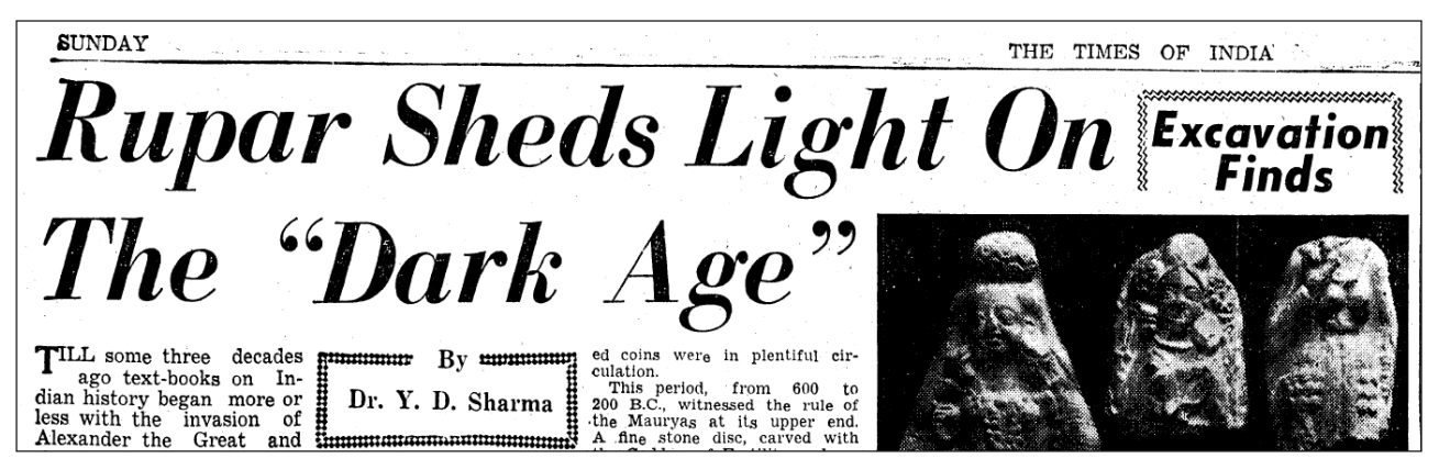
Figure 2: Image from Sharma, Y D's article in The Times of India on his archaeological recovery at Rupar in 1954.

believed that some aboriginals had "retained traditions of movements and displacement" and, thus, the hills and forests where aboriginals lived, were not their historical territories (1958: 144). Subbarao's views are reflected in an accompanying illustration in which "Tribal India" stands as a homogenous unit, apart and distinct from his eight ecological and political regions ( Fig. 3 ).