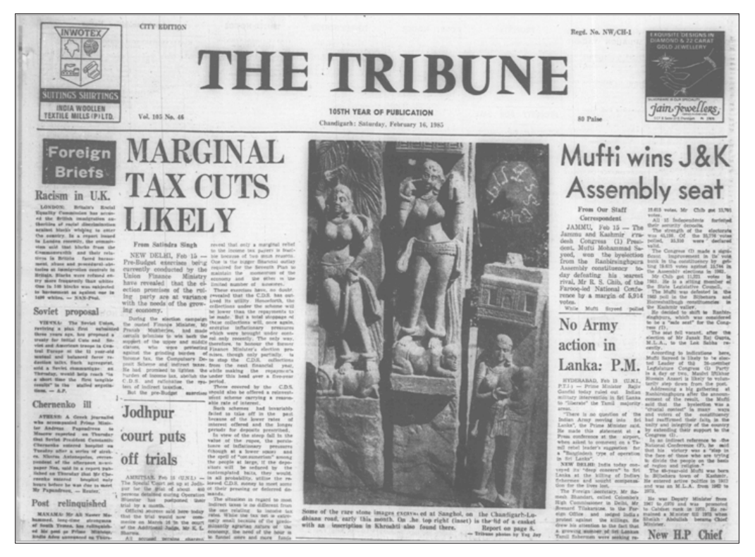
Figure 4: Image showing the front page of The Tribune from February 16, 1985, to announce the Punjab Department's recovery of sculptures. The original caption reads 'Some of the rare stone images excavated at Sanghol, on the Chandigarh-Ludhiana road, early this month. On the top right (inset) is the lid of a casket with an inscription in Khroshti also found there. Tribune photos by Yog Joy'.

In early 1985, the Punjab Department of Cultural Affairs, Archaeology and Museums announced its recovery of 69 pillars, 13 coping stones and 35 crossbars in Sanghol (Directorate 1985: 3). In its initial report submitted to the Survey, department officers<sup>17</sup> described the finds as "epoch making" and the "biggest discovery of the century in the field of Indian archaeology" ( Fig. 4 ). In this context, the Punjab department invited Survey archaeologists to conduct field investigations at Sanghol, raising the question of how did Survey archaeologists collaborate with their counterparts in the Punjab department amid the visceral